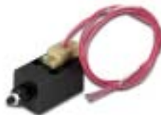
CJB-1 Series Pressure Switches