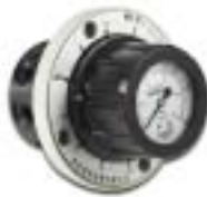
Pressure Gauge switch-01