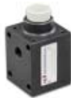
Pressure Gauge Shutter-01