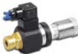
LPS-01 Pressure Switch