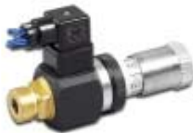
LPS-01 Pressure Switch

Lps-01 Pressure Switch LPS-01 series piston pressure switches are adopted micro-switch to conntrol the start or